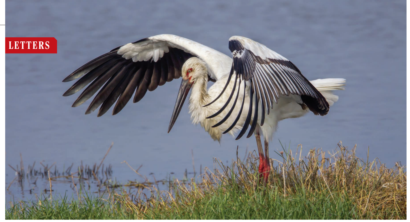
The Oriental stork (Ciconia boyciana) is threatened by human activities in its migratory stopover points in China.